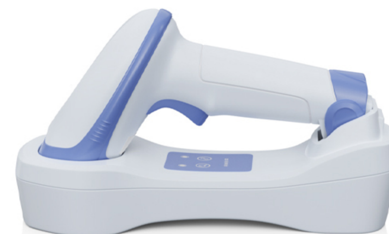
BR300 Wireless Barcode Scanner with 2.4Ghz USB Charging Station