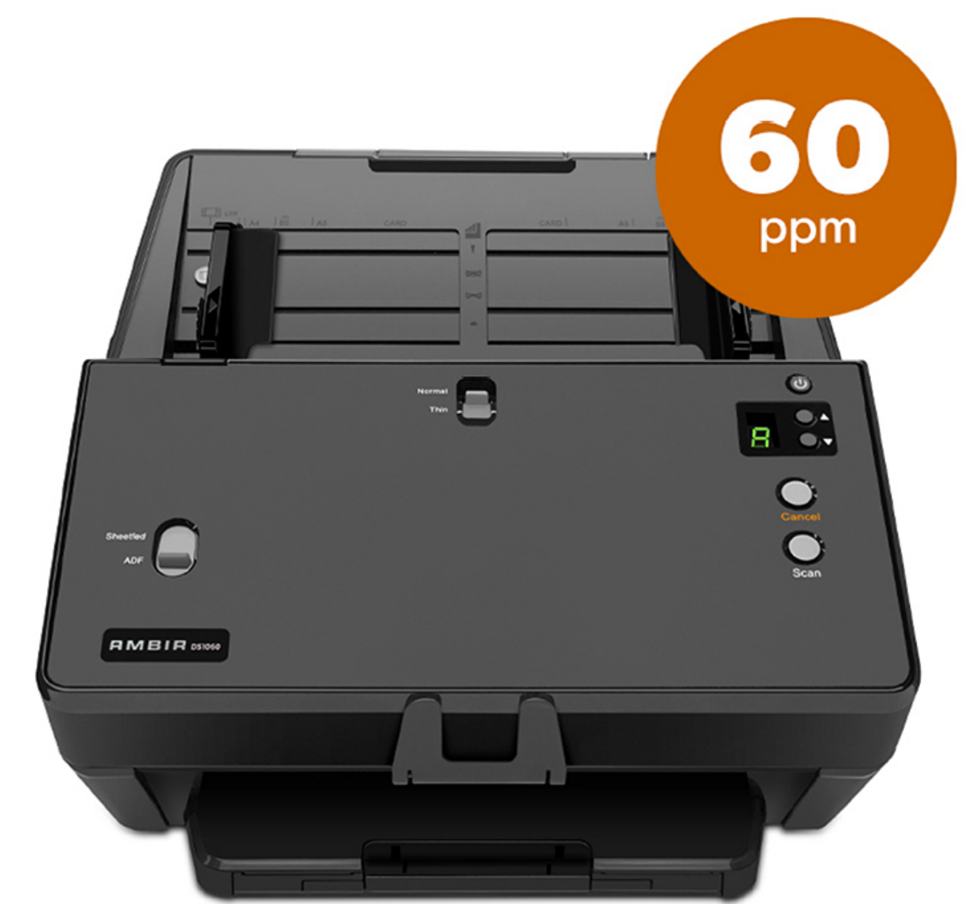
nScan® 1060 Part Number # DS1060-AS

Versatile and powerful to tackle any job; including passports.