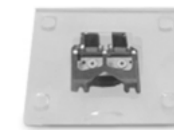
ADF Feed Pads