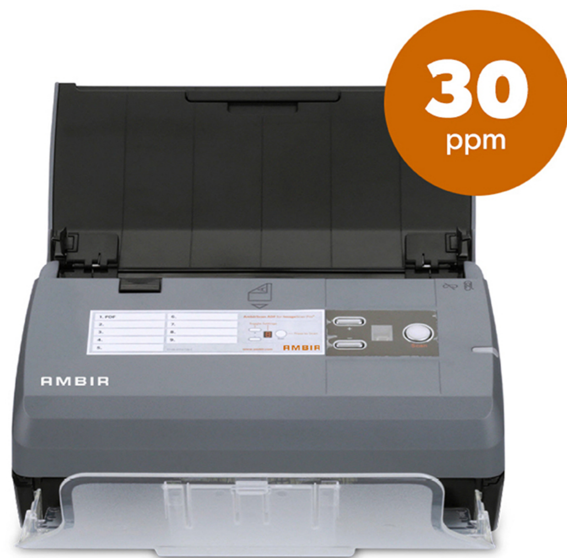
ImageScan Pro® 830ix Part Number # DS830IX-AS

A smart option for handling more paperwork.