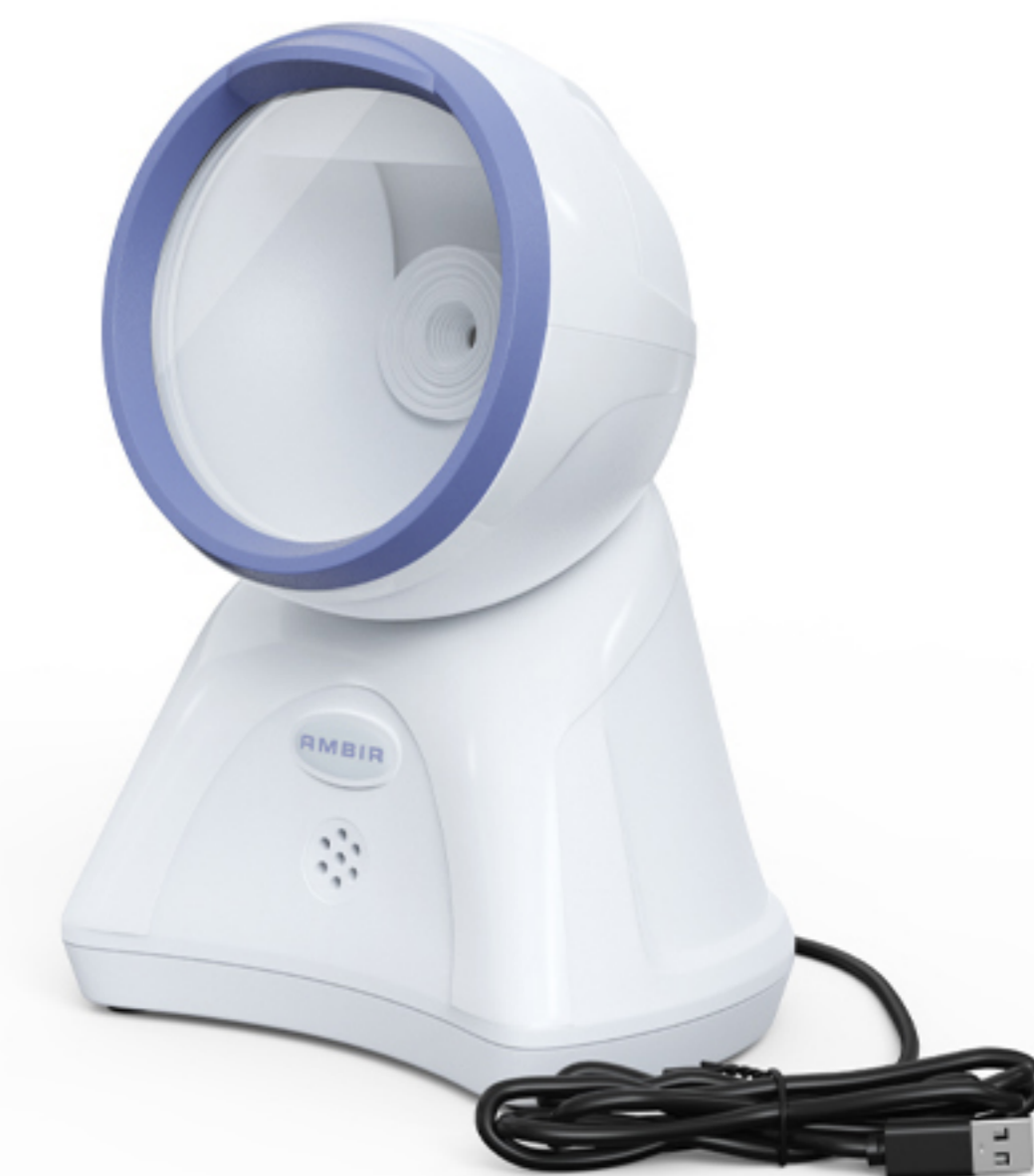
DB100 Omni-directional Desktop USB 2D Barcode Reader