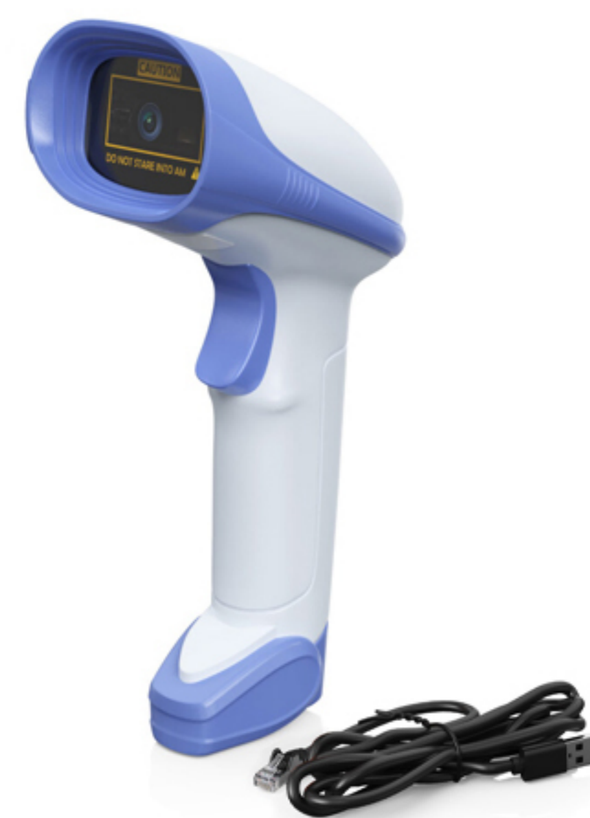
BR100 USB Barcode Scanner

USB connection for plug & play installation and use.