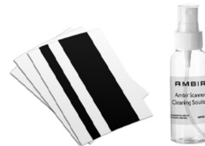
Cleaning & Calibration Kits