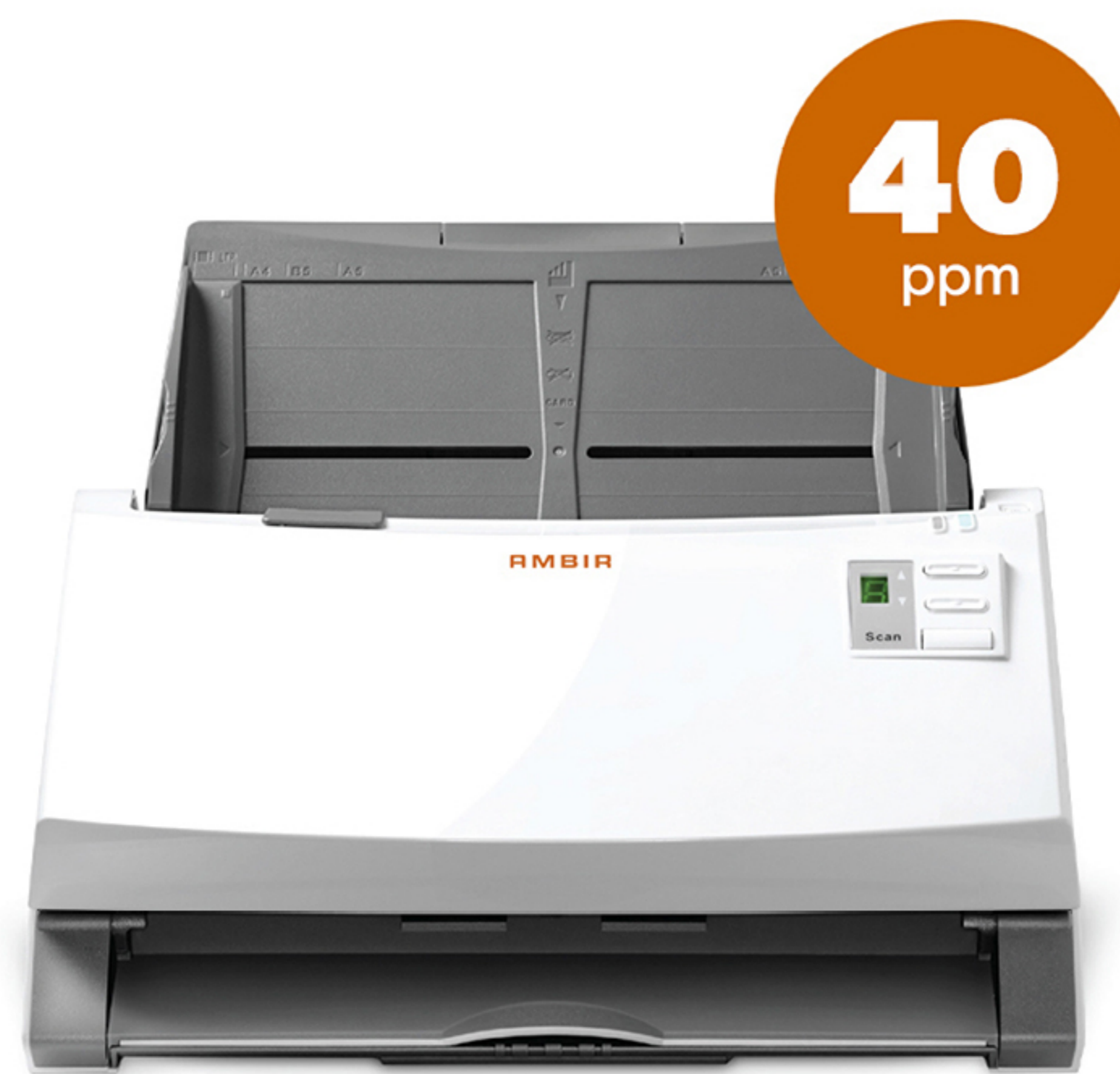
ImageScan Pro® 340 Part Number # DS340-SE

Designed for bulk jobs and heavy workflows.