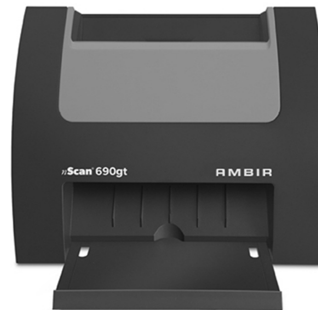
nScan™ 690gt Part Number # DS690-AS