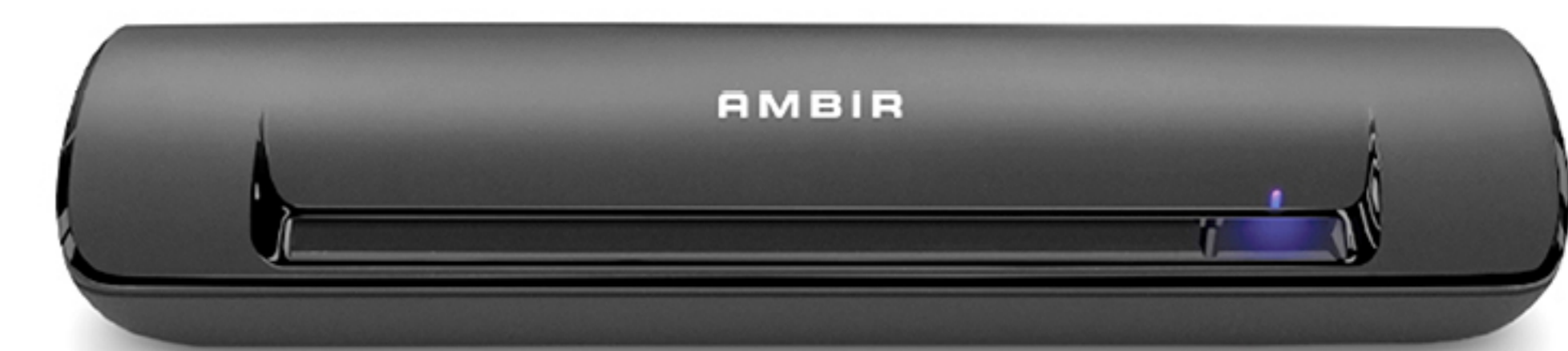
ImageScan Pro® 490i Part Number # DS490-AS