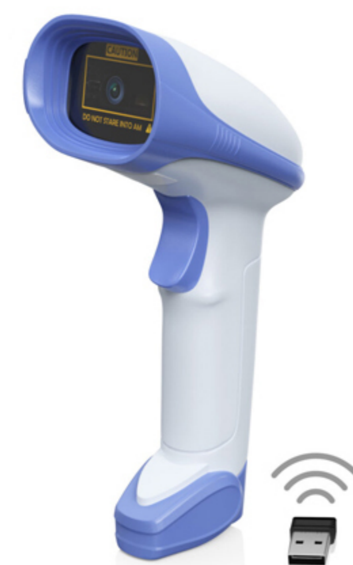
BR200 Wireless Barcode Scanner with 2.4Ghz with Wireless USB Dongle