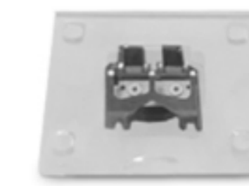
ADF Feed Pads