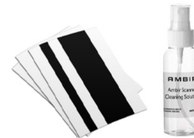
Cleaning & Calibration Kits