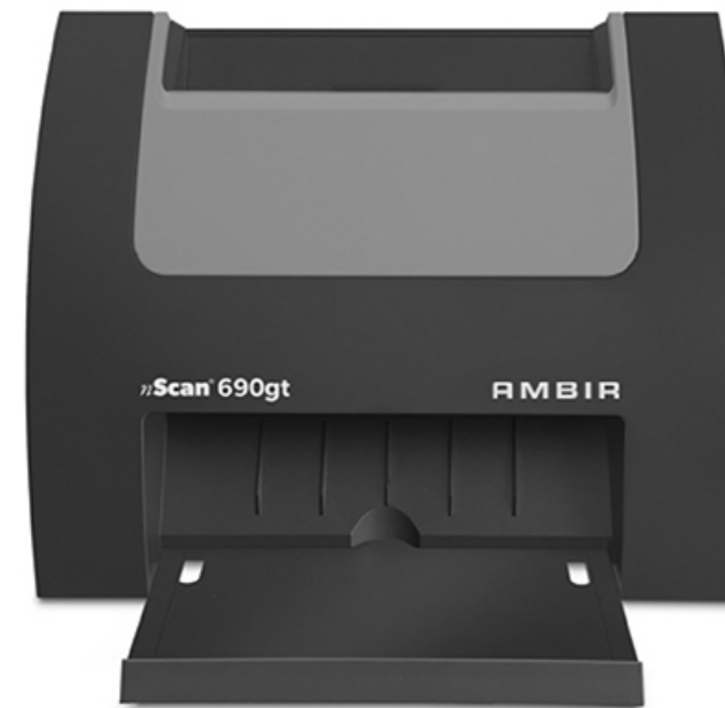
nScan™ 690gt Part Number # DS690-AS