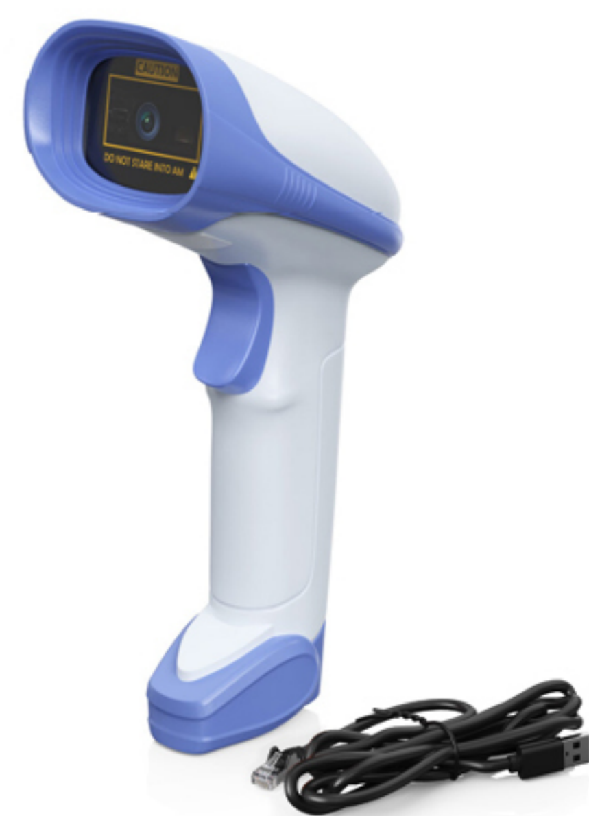
BR100 USB Barcode Scanner

Compatible with keena Healthcare Technology